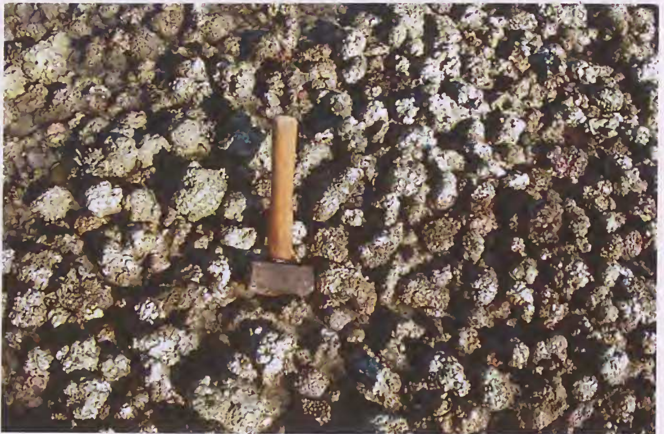
Figure 13. Rhodoliths on the reef crest (see Fig. 12). Some of these have a coral fragment core but the majority are entirely of algal construction.